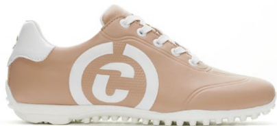
CHAMPAGNE / WHITE 122003-111 (2nd lace colour: champagne)