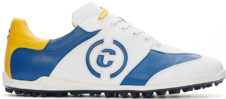
VALDERAMA 122252-122 JEANS / WHITE / YELLOW (2nd lace colour: yellow)