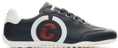
NAVY 121251-122 (2nd lace colour: white)