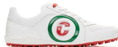
WHITE / GREEN / RED 121276-100 (2nd lace colour: red)