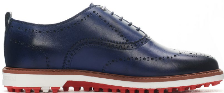
CHURCHILL 122255-122 ROYAL BLUE (2nd lace colour: white)