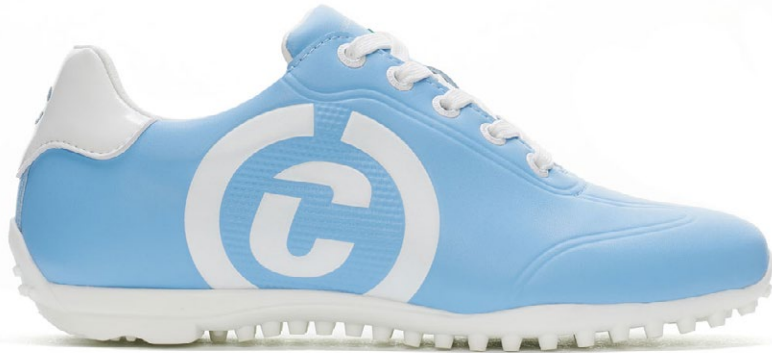
QUEENSCUP 122002-120 LIGHT BLUE / WHITE (2nd lace colour: light blue)