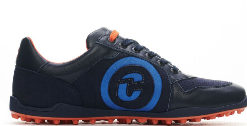
KUBA 2.0 122251-122 NAVY / NAVY (2nd lace colour: orange)