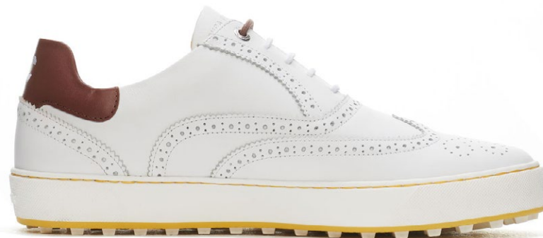
REGENT 122256-100 WHITE (2nd lace colour: cognac)