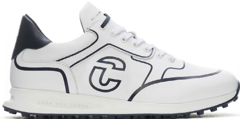
FLYER 122258-100 WHITE / NAVY (2nd lace colour: navy)