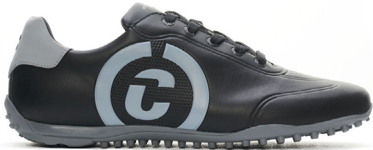
KINGSCUP 122250-109 BLACK (2nd lace colour: dark grey)