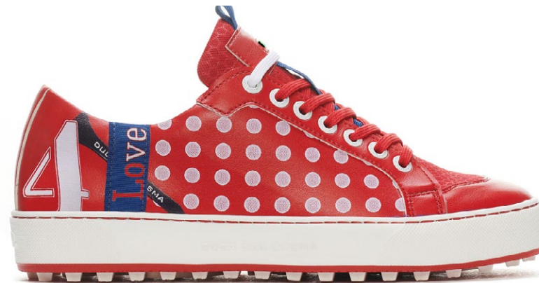
ESTI 122016-142 RED (2nd lace colour: white)