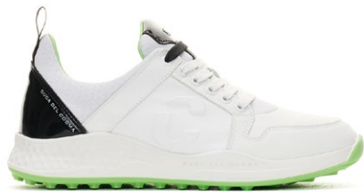
WHITE 121027-100 (2nd lace colour: black)