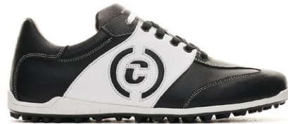
BLACK 121258-109 (2nd lace colour: white)