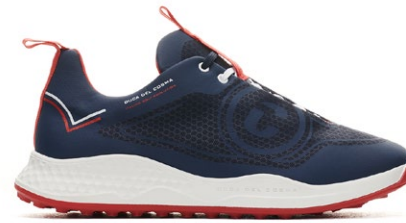
NAVY 121275-622 (2nd lace colour: navy)