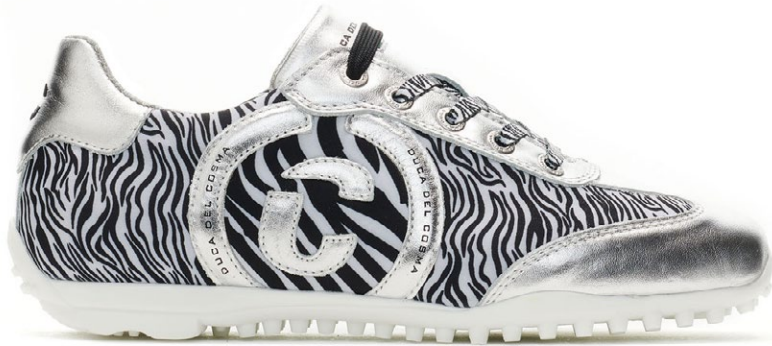
KUBANA 110101-61 SILVER / ZEBRA (2nd lace colour: black)