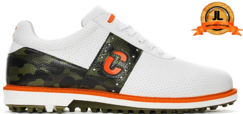
JL1 121305-100 WHITE / CAMOUFLAGE GREEN (2nd lace colour: orange)