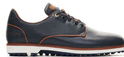
NAVY 121267-122 (2nd lace colour: cognac)