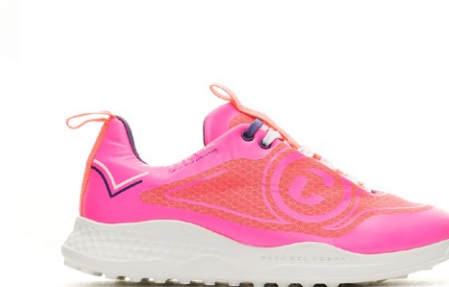
PINK FLUO 121023-641 (2nd lace colour: navy)