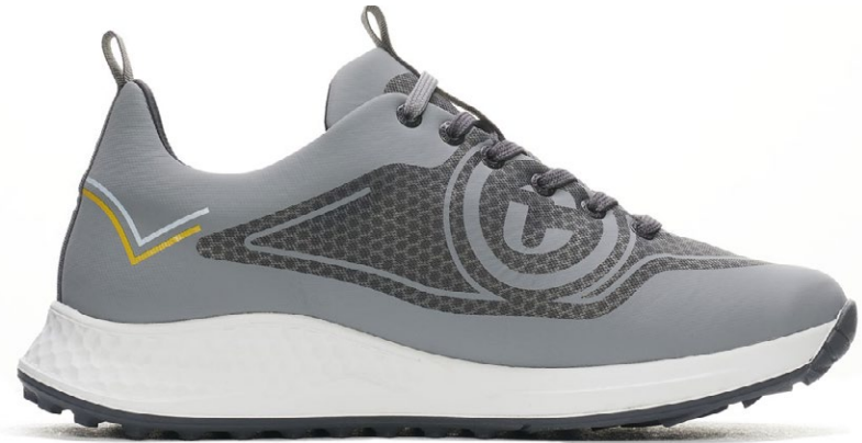
TOMCAT 122260-603 LIGHT GREY (2nd lace colour: light grey)