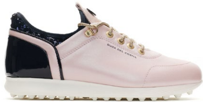
PINK / NAVY 111201-41