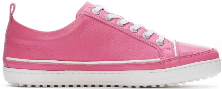
FESTIVA 122017-141 PINK (2nd lace colour: pink)