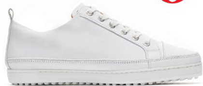
WHITE 111401-00 (2nd lace colour: light blue)