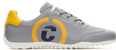
GREY 121252-103 (2nd lace colour: white)