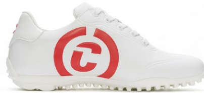
WHITE / RED 122001-100 (2nd lace colour: red)