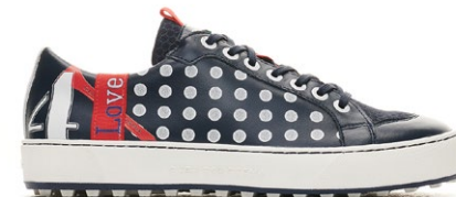
NAVY 121016-122 (2nd lace colour: white)