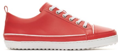
RED 121018-142 (2nd lace colour: red)