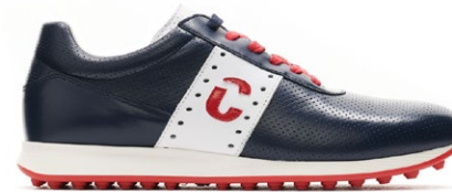
NAVY 120891-21 (2nd lace colour: navy)