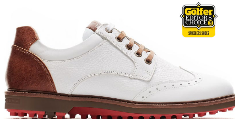
ELDORADO 125492-00 WHITE (2nd lace colour: white)