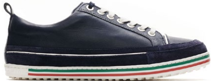
NAVY 161491-22 (2nd lace colour: navy)