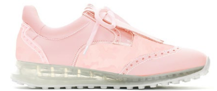
PINK / CAMOUFLAGE 122019-141