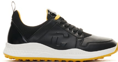
BLACK 121026-109 (2nd lace colour: yellow)