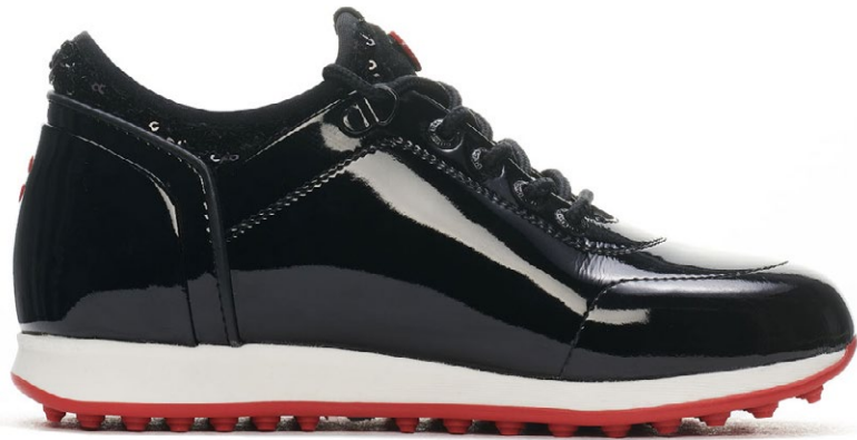
POSE 122012-109 BLACK