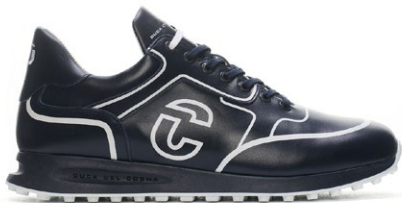
NAVY / WHITE 122259-122 (2nd lace colour: white)