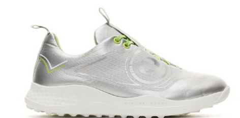
SILVER 121024-603 (2nd lace colour: white)