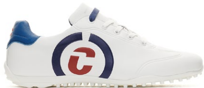
WHITE 121205-100 (2nd lace colour: navy)