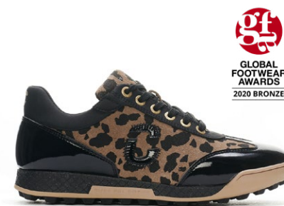
BLACK / CHEETAH 120500-109