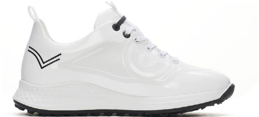
WILDCAT 122009-600 WHITE (2nd lace colour: black)