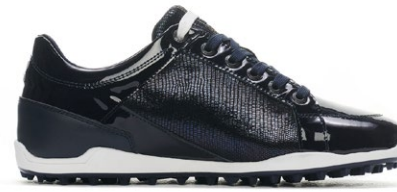
NAVY 122008-122 (2nd lace colour: white)