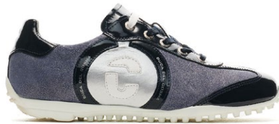
NAVY / SILVER 110191-22 (2nd lace colour: white)