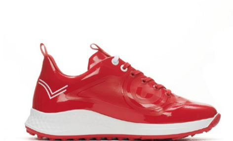
RED 122010-642 (2nd lace colour: white)