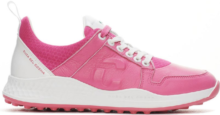
SIREN 122011-141 PINK (2nd lace colour: pink)