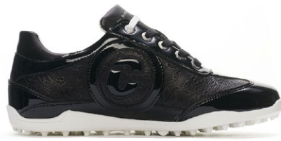
BLACK 122004-109 (2nd lace colour: white)