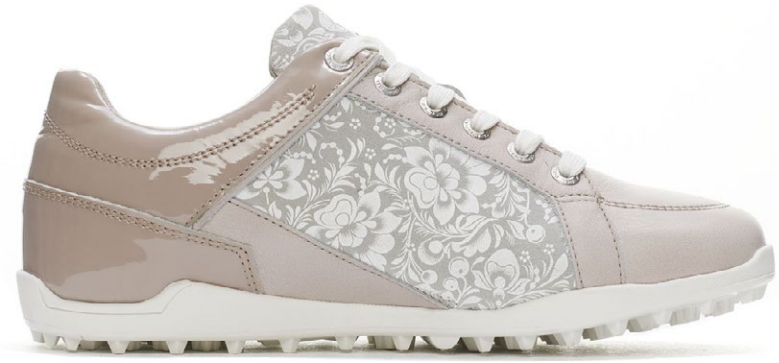
CALDES 122007-111 BEIGE / FLOWER (2nd lace colour: beige)