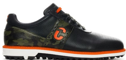
JL2 121306-109 BLACK / CAMOUFLAGE GREEN (2nd lace colour: orange)