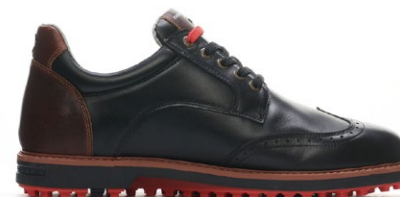
BLACK 125492-09 (2nd lace colour: red)