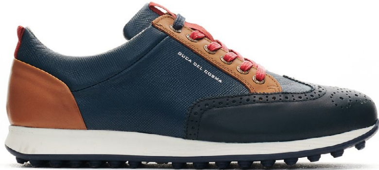
CAMELOT 125382-22 NAVY / COGNAC / RED (2nd lace colour: navy)