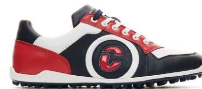
NAVY / WHITE / RED 121277-122 (2nd lace colour: navy)