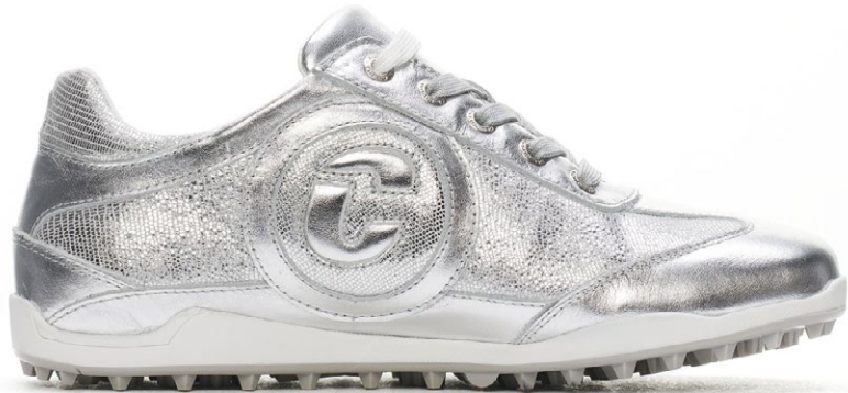
KUBANANEO 122006-161 SILVER (2nd lace colour: white)