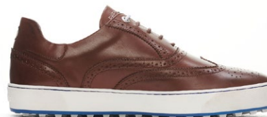
COGNAC 122257-116 (2nd lace colour: white)