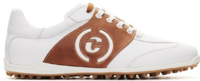
WHITE 121257-100 (2nd lace colour: cognac)