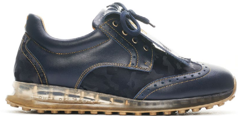
BELLEZZA 122018-122 NAVY / CAMOUFLAGE