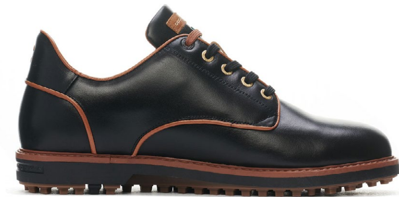
ELPASO 122253-109 BLACK (2nd lace colour: cognac)