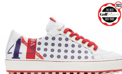
WHITE 110701-00 (2nd lace colour: white)