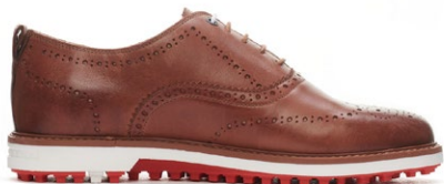
COGNAC 122254-116 (2nd lace colour: white)