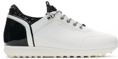
WHITE / BLACK 111201-00