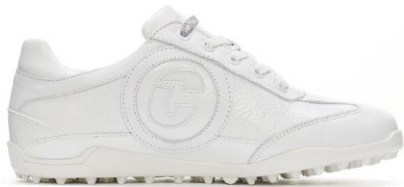
WHITE 122005-100 (2nd lace colour: silver)